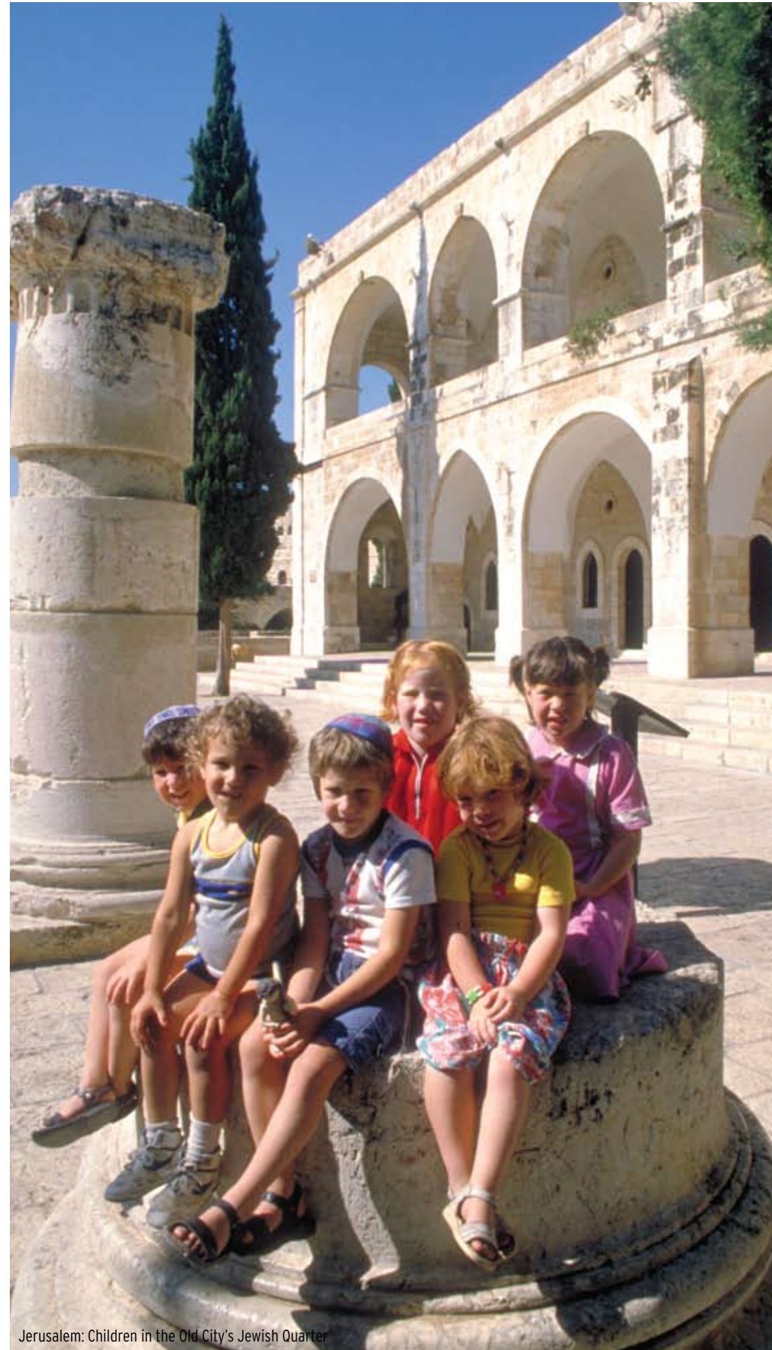
Jerusalem: Children in the Old City's Jewish Quarter

To visit Bethlehem and Jericho , the two main tourist areas in the parts of the West Bank that are controlled by the Palestinian Authority, no prior clearance or authorization is required.