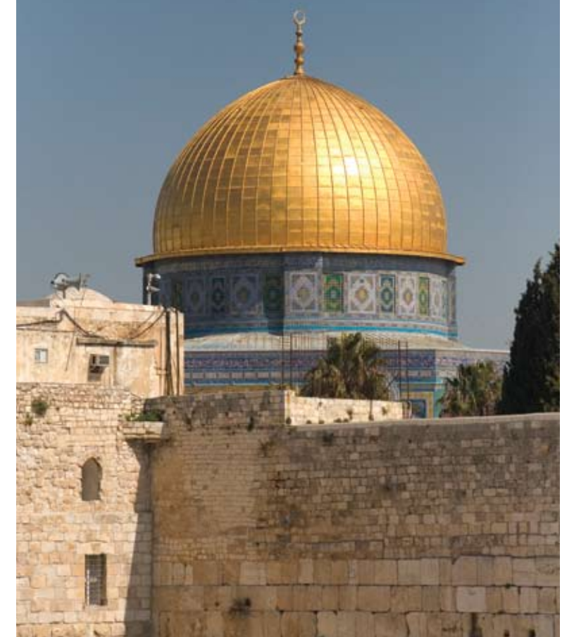
The Dome of the Rock, Jerusalem