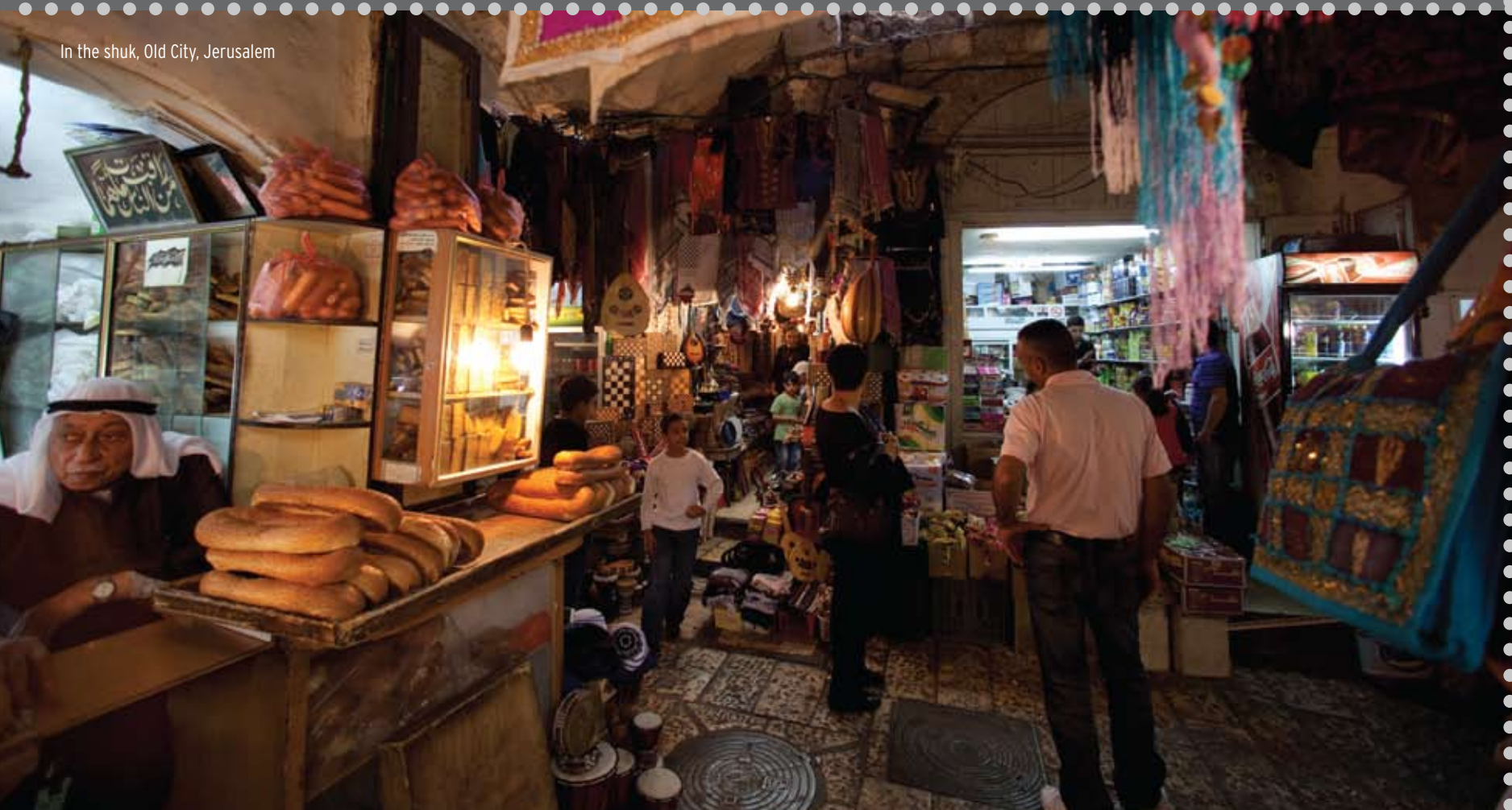
In the shuk, Old City, Jerusalem

Tip 10%-15% in restaurants. In upscale hotels and restaurants, a 15% service charge may be included in the bill. Tipping taxi drivers is not expected but gladly accepted when offered. On the other hand, tour guides and their bus drivers usually expect tips. Hotel staff is appreciative when tips are left.