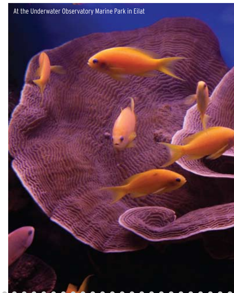
At the Underwater Observatory Marine Park in Eilat

EILAT HOTELS: The Dan Eilat and the Dan Panorama Eilat , with 374 rooms and 277 rooms, respectively, provide different angles on all the fun. The former is located on the Red Sea beachfront and the latter overlooks the Lagoon , a few minutes from North Beach . The Hilton Eilat Queen of Sheba Hotel , centrally located, touts its seafloor pool, Red Sea views, spa and an adjoining shopping mall. And Holiday Inn's Crowne Plaza Eilat Hotel , located on the Promenade , seems to be a very kid-friendly establishment as its Freckles Club , equipped with movies, games and arts and crafts, promises not to place a blemish on any vacation.