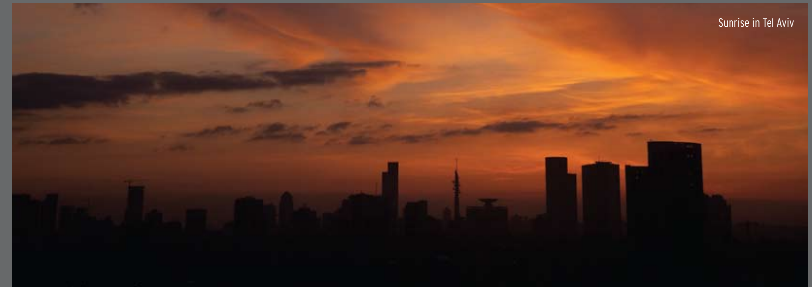
Sunrise in Tel Aviv

same. Some Orthodox Jewish men will not accept a business card directly from a woman; in such cases, she should place it on a table where he can reach it. When exchanging business cards, take time to carefully read the card of your acquaintance, and treat it with respect. During a meeting, leave the card on the table in front of you. Most Israeli businesspeople speak English. Use professional or standard English titles (Mr., Ms.) along with the person's last name until instructed otherwise.