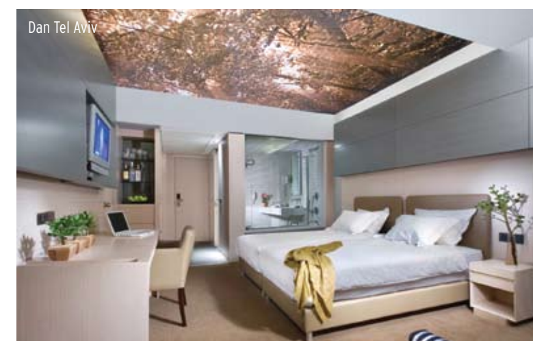
Dan Tel Aviv

And Holiday Inn's Crowne Plaza Tel Aviv Hotel is positioned on the seashore promenade, close to the city center and just 11 miles or so from Ben Gurion Airport. The Crowne Plaza Tel Aviv City Center is on Menahem Begin Road, near the landmark Azriela Towers . The city also boasts numerous boutique properties, including the Leonardo Boutique Hotel Tel Aviv , the Cinema Hotel and Hotel Montefiore .