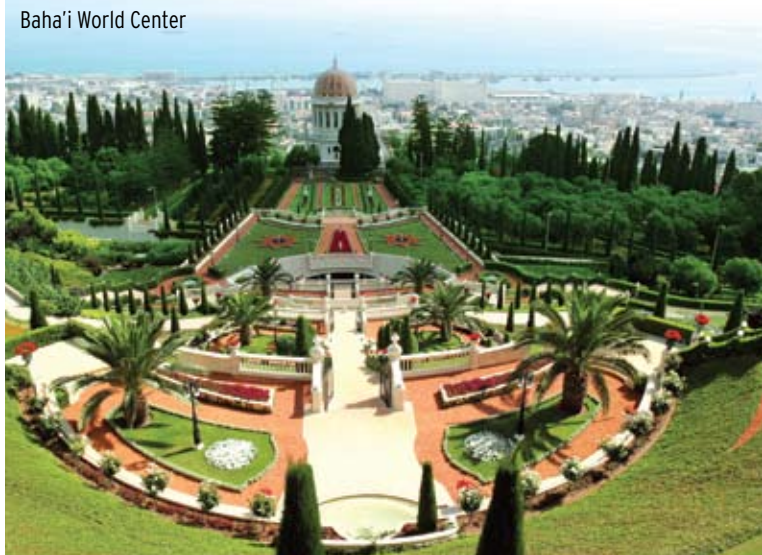
Baha'i World Center

The wonders of Haifa extend from the port, which serves as a gateway for commerce and cruise ships, to the heights of Mount Carmel , with the Baha'i World Center , and its sculpted garden and shrine, serving as a bookmark for the city. The Haifa Funicular , which shuttles visitors from Bat Galim promenade to the upper reaches of Mount Carmel, all the while offering a lookout onto the blue Mediterranean and shipping lanes below, is an alluring attraction for adventurous souls.