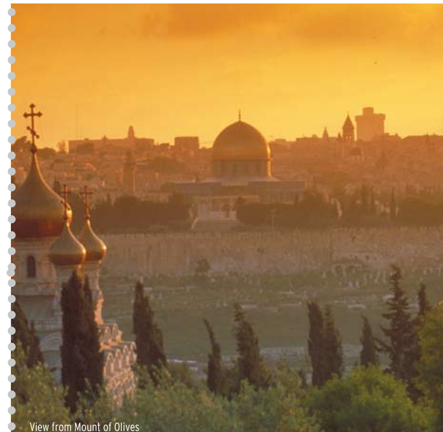
View from Mount of Olives

Travel agents earn Collette commission on door-to-door, pre-sold options, and on land and contract air when purchased with a tour. The Israel tour comes with guaranteed departure dates (i.e. they can't be cancelled if passenger numbers are insufficient), and the Collette No Worries Cancellation Waiver guarantees clients a cash refund even if they cancel the day prior to departure. For information about the tour, visit www.collettevacations.com/travel-agent.cfm .