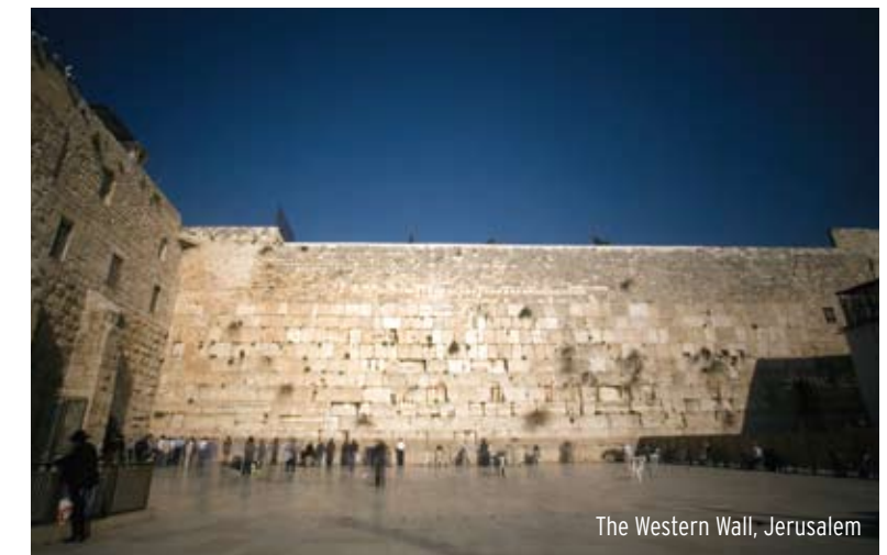
The Western Wall, Jerusalem