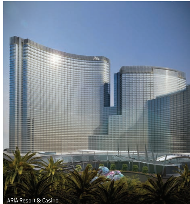
ARIA Resort & Casino

ARIA Resort & Casino, located in the heart of CityCenter, will be a dramatic, yet graceful combination of striking architecture, impeccable hospitality and sustainable design. Designed by the world-renowned firm Pelli Clarke Pelli, ARIA's architectural expression will reveal itself at every turn. From its soaring three-story lobby to the naturally lit casino and spectacular public spaces, ARIA will provide guests unmatched experiences.