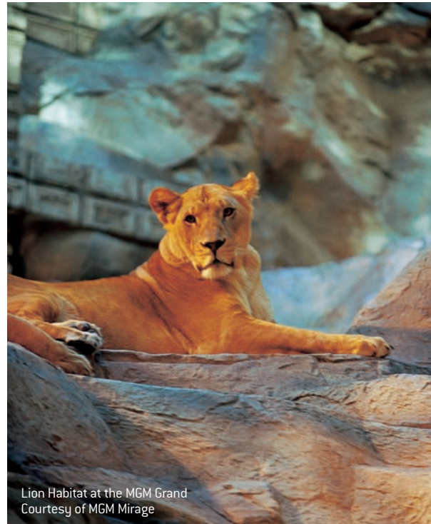
Lion Habitat at the MGM Grand

As VIP guests, the cats in the Lion Habitat at the MGM Grand split their time between playing and lounging at the hotel and spending time with their exotic animal trainer at a nearby ranch. Advise your clients, if they're true enthusiasts, to spend some time observing the animals when they're at the hotel's free viewing area; trainers give complimentary presentations often, but the timing is always determined by the mood of their feline friends.