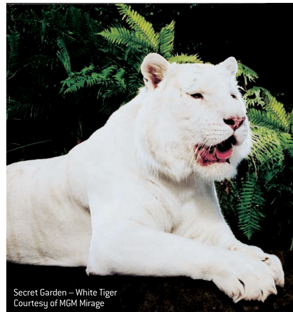
Secret Garden – White Tiger

One of the forerunners of the shift to themes and big spectacles, The Mirage's tropical motif centers on the South Seas. Outside is a gigantic waterfall topped by a volcano that “erupts” on the hour 6 p.m.–midnight, with elaborate lighting effects simulating the lava flow. The resort also houses the Secret Garden (for a $15 admission fee), a misted, lush sanctuary featuring a dolphin habitat, along with rare white tigers and other animals that have performed with famed illusionists Siegfried & Roy.