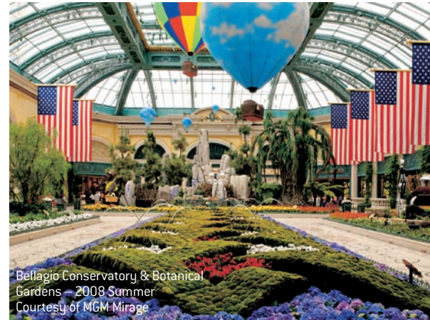
Bellagio Conservatory & Botanical Gardens – 2008 Summer

At Bellagio Conservatory & Botanical Gardens , landscapes and displays change five times annually to match the themes of Holiday, Chinese New Year, Spring, Summer and Fall. No matter when your clients visit, they'll never see the same thing twice in the free exhibits; even the flowers are changed out every two weeks. Although the displays themselves are shows, light, sound and water features help create a complete and breathtaking experience.