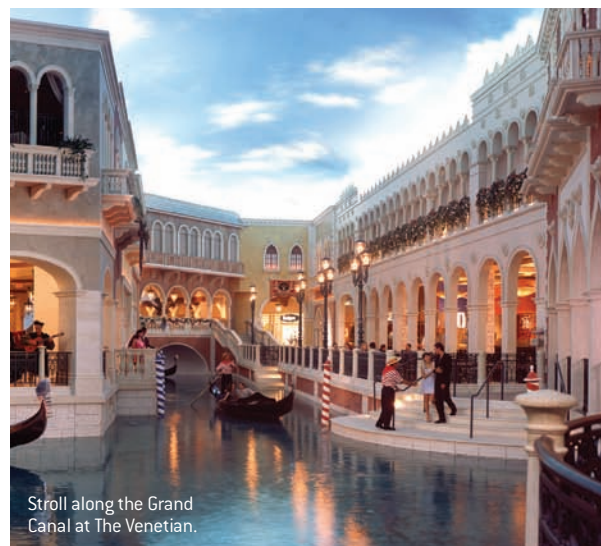
Stroll along the Grand Canal at The Venetian.

Club Grazie is the premier resort loyalty program that lets you choose your level of rewards. Hosted in The Venetian and The Palazzo, the world's most sophisticated and electrifying resort-hotel-casinos, Club Grazie is your all-access VIP pass to splendid suites, delectable dining, sensational shopping and unrivaled recreation — simply play your favorite games or charge to your suite. With your Club Grazie card, all the treasures of both resorts are at your fingertips.